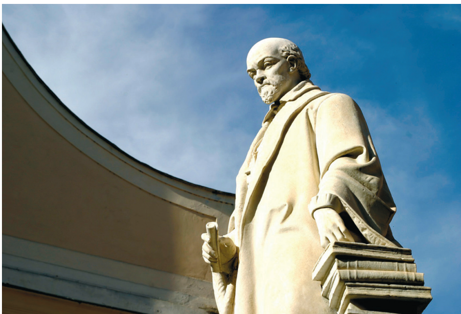
Figure 1. Monument to Giovanni Botero in his native city of Bene Vagennia, Cuneo, Piedmont (1871).

It is probably fair to say that cameralist and mercantilist tradition grew out of two much older and overlapping traditions