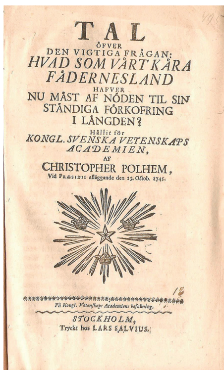
Figure 2. Christopher Polhem (1661-1751). Swedish Inventor and Economist. In this 1745 speech and pamphlet Polhem uses the argument first used by Antonio Serra (1613): diminishing returns in the mining sector is a reason